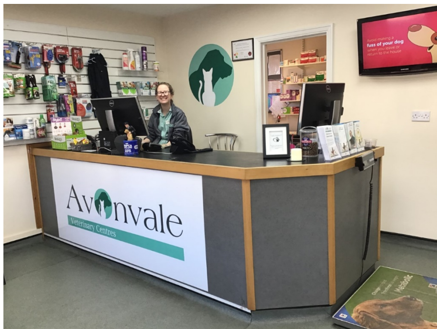
When you arrive at the surgery, please go to the reception desk and tell them who you are and your pet's name.