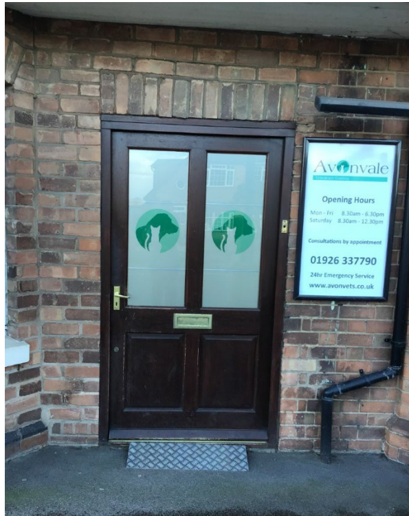
The entrance to the surgery is through this wooden door.