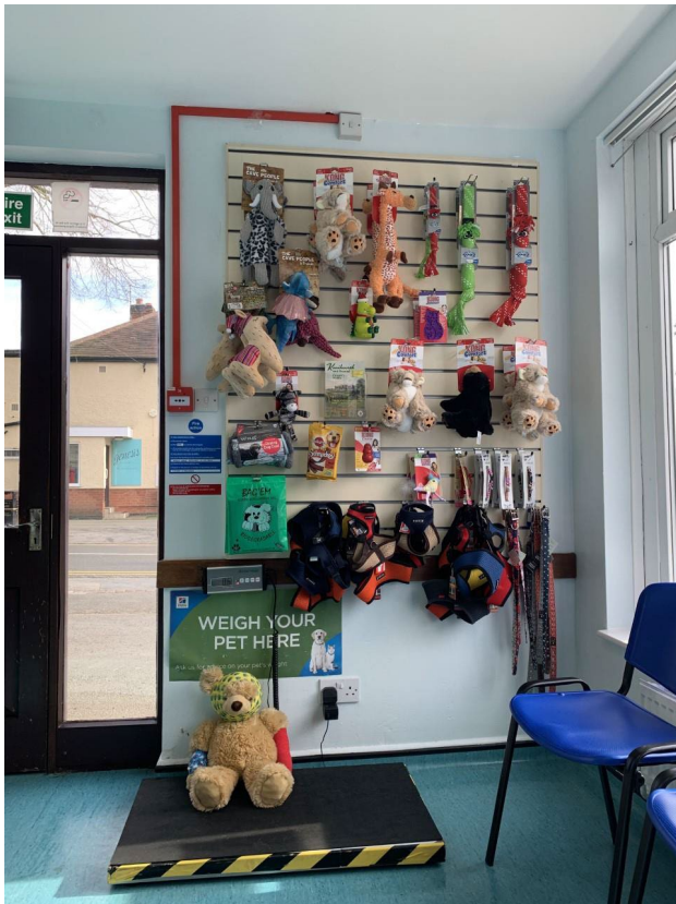
A member of staff might help you to weigh your dog on these scales which are in the corner of the waiting room ...